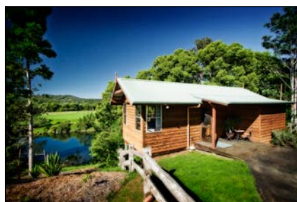
Dark and Moody.