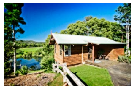
Light and Airy (used especially on shoots that focus on interiors and for accommodation providers)