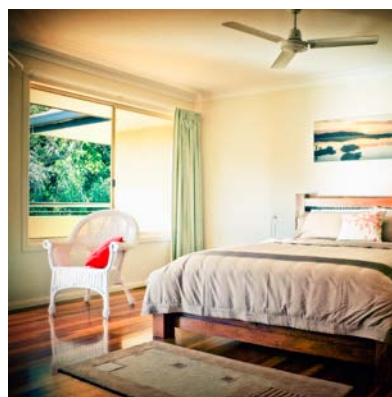
Light and Moody - contrast is tweaked, grain added, the highlights are made to glow slightly, plus a very subtle colour cast added to the shadows.