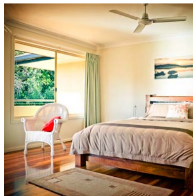
Clean and Simple - a subtle vignette is applied to draw the eye into the picture.