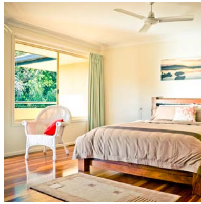
Minimal processing (these shots have been straightened, colour and contrast tweaked).