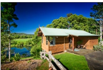
Crisp and Clear